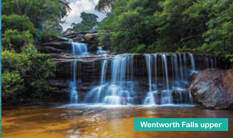
Wentworth Falls upper