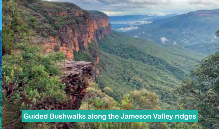
Guided Bushwalks along the Jameson Valley ridges

Fill your day your way with sightseeing, charming village strolls, and cosy dining plus your choice of activities.